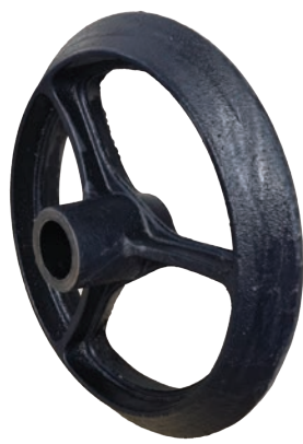
Delmade Specification Cast Ring Roller Segment 19" x 2-1/2"